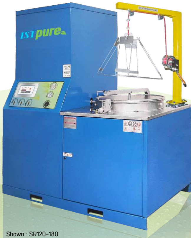
Shown : SR120-180

Large capacity solvent recyclers are suitable for industrial enterprises with a consumption volume equivalent to about 240 liters per day or less. These units are ultra-compact and are equipped with explosion-proof devices. They can therefore be installed easily in a location that allows this type of equipment and can be used on a daily basis.